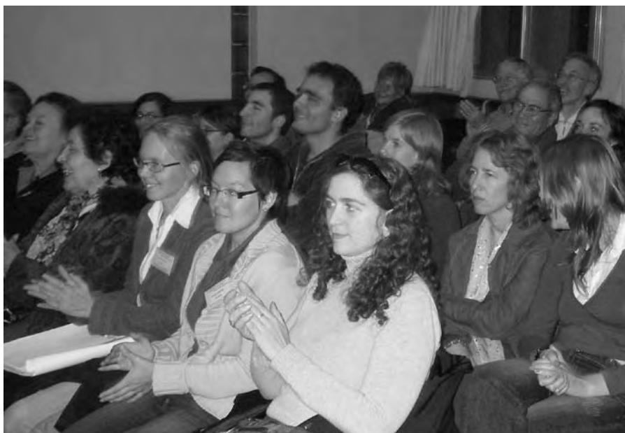
Closing ceremony of the conference in the University of La Pampa.

The reason I chose this topic is because international frontiers are sensitized regions where two political systems and two cultures come face to face. Borders usually provide a valuable resource for a better understanding of the effects from which socio-cultural identities arise within folk groups, those groups that produce, perceive, perform, recognize or value a particular behaviour that we call folklore. Intercultural communication is much more frequent on borders than in other areas, and the in-group as well as the out-group often strengthen identity-features, local pride, conflicts and nationalistic reactions. Besides, people living at the border use stereotypes to describe their neighbours on