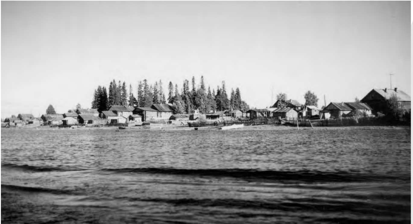
The village of Paanajärvi by the river Kemijoki is one of the oldest settlements in Viena Karelian area. In 2005, the local people of Paanajärvi and the Juminkeko Foundation were awarded the Europa Nostra medal "for the preservation of the fine wooden architecture of a remote village, the revitalisation of the traditional building techniques and safeguarding of its unique cultural heritage through sustainable income-generating initiatives" ( http://www.europanostra.org/lang_en/index.html ).