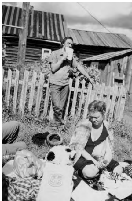
Seminars in different settings:

Secondly, the Karelian villages offered the participants of the FFSS a good opportunity to understand the situation and position of Karelia as a borderland and a multicultural environment, where the local Karelians and Russians experience the presence of non-villagers not only through welcoming city-born relatives and friends or through the immigration of Russian and Belorussian newcomers, but also by hosting Finnish or Swedish tourist groups for one or two nights. And who represented this multiculturalism better in these small villages than the participants of the Summer School? It was indeed noticeable that our kind hosts in the villages were sometimes really excited to have