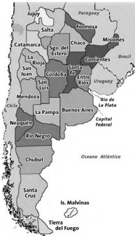
Provinces of Argentina.

and Agüero Vera. Furthermore, as I will try to show in the following, these new archives indicate a shift towards a paradigm of folklore based on studies of regional contextual variation, as well as towards research reflecting on the process of constructing narrative messages (Jakobson 1964) as well as on channels and codes of circulation of the narrative material.