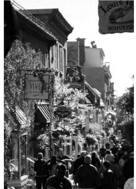
The Lower Town of Québec City, not far from the site of the 2008 AFS/FSAC joint annual meeting.

A persistent theme was that of space: the symbolic meaning of the concept, different (emic-etic) interpretations of space, the politics of these interpretations (as described vividly in a paper by Anna Lydia Svalastog (Dalarna College), "Colonizers, Maps, and Creation Myths: The Swedish Case" in the panel on Scandinavian identities), and the (most often etic) detachment of time and space with the related politics of representing the other. Another topic that featured in a number of panels was the medium itself: how the medium, above all the Internet, changes the tradition it conveys. The Internet includes all kinds of distinct and mixed genres, and transmits remakes and "mash-ups" of known stories, beliefs, etc (e.g. as exemplified in the paper by Elizabeth Tucker of Binghamton University, "Guardians of the Living: Characterization of Missing Women of the Internet"). New media, with their opportunity for multivocal, simultaneous, global in-