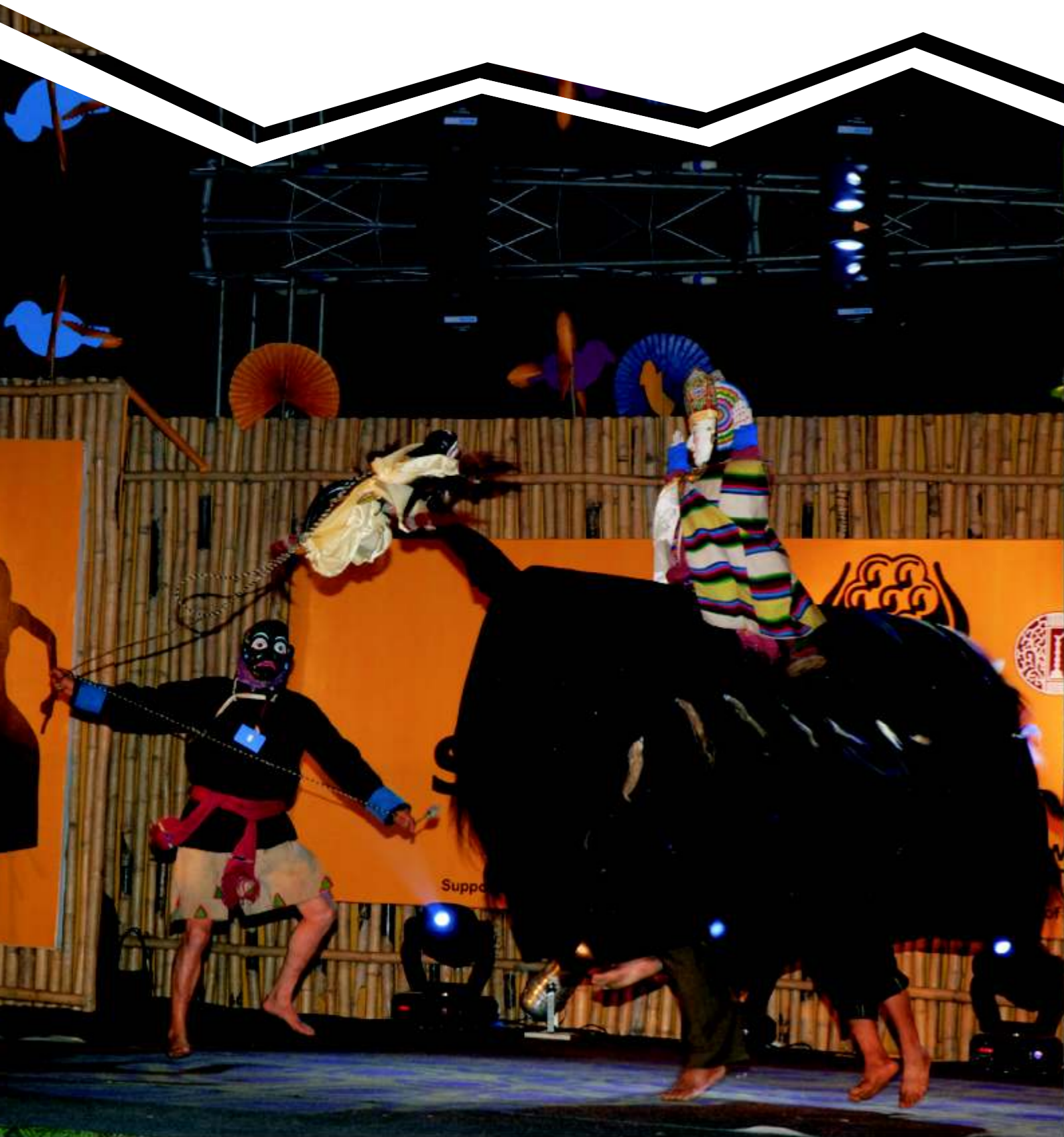
The /Yak Dance/ performed by folk performers from Arunachal Pradesh at the Festival of South Asian Folklore in New Delhi, December 2007.