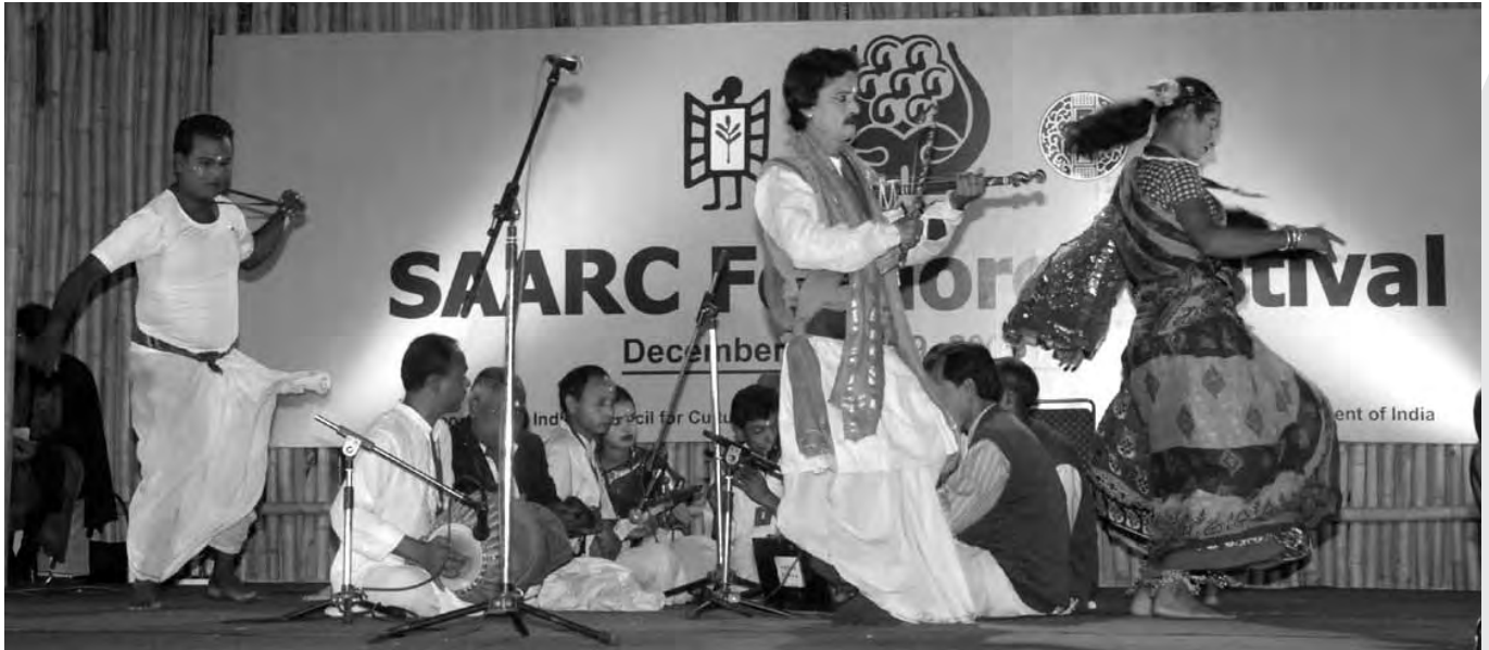
Folk artists from Rajarhat, Kurdigram, Bangladesh who continue the indigenous art form Kushan Gaan, presenting scenes from Ramayana.