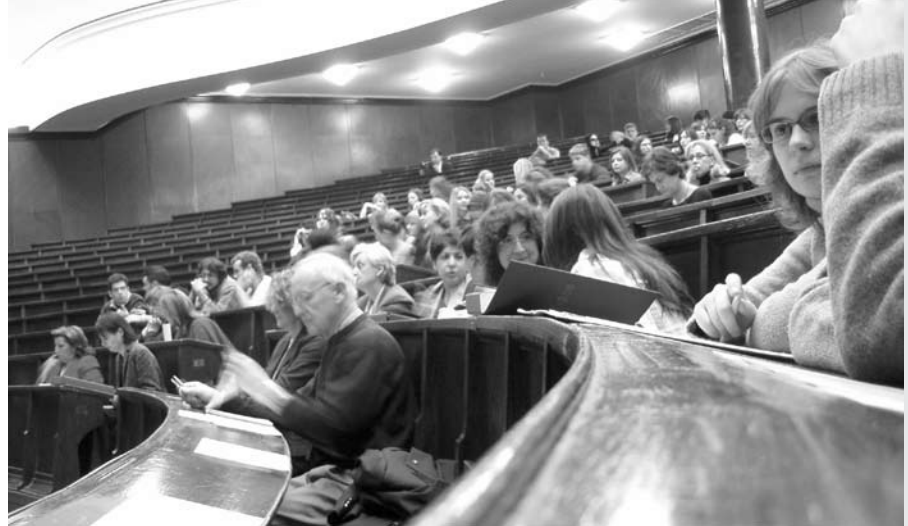
Getting ready for advances in oral literature research: glimpse of the conference venue and the audience before the start of a session.