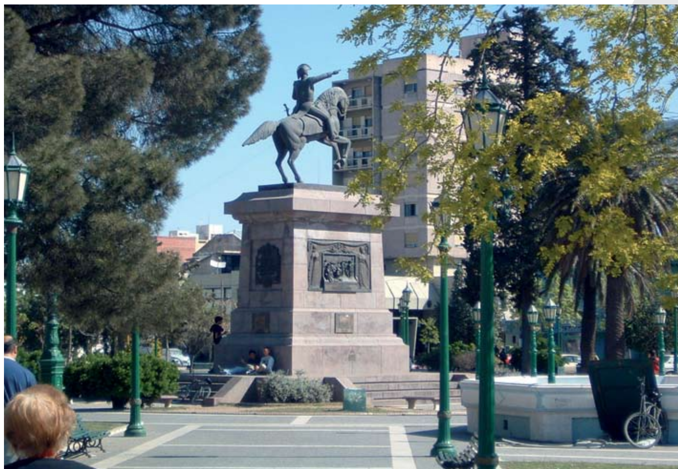
Plaza San Martín is the central square of Santa Rosa, La Pampa. The statue figures General José de San Martín (1778-1850), the national hero of Argentina and the first president of Peru.