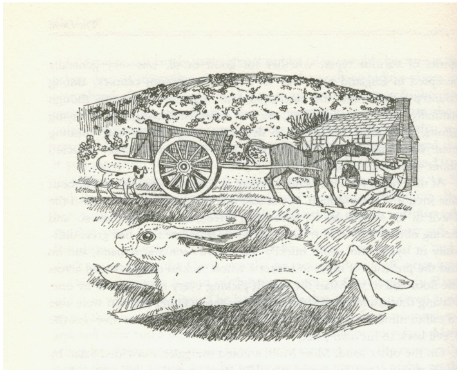
Illustration from: Folklore of Sussex, p. 66. Artist unknown.

Note: this little article has been send in without having undergone the usual process of correction and reformulation. My apologies for any remaining mistake.